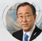
Ban Ki-Moon Former Secretary-General of the United Nations

It is a process that involves active and compassionate listening in pursuit of discovering common understandings as well as differences in perspectives and viewpoints.