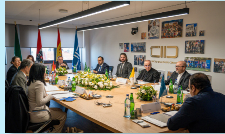
KAICIID's Council of Parties meeting in Lisbon, Portugal.