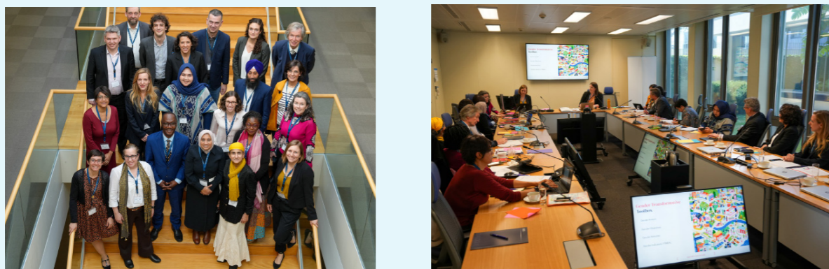
KAICIID hosts the International Partnership on Religion and Sustainable Development (PaRD) leadership meeting.

Between 27 and 29 February 2024, Lisbon was the setting for the 2024 Spring Leadership Meeting of the International Partnership on Religion and Sustainable Development (PaRD), hosted by KAICIID. As one of the three co-chairs representing the multilateral organizations' constituency, KAICIID led discussions that epitomized the spirit of cooperation and shared vision among PaRD's 170 members. The meeting, primarily an internal governance gathering, was a vibrant consultation forum for the Steering Board members, co-leads of workstreams, and task forces to deliberate on PaRD's Operational Plan for 2024, budget and financial planning, and the identification of key engagements and initiatives in the coming year. KAICIID organised a reception in which the participants of the Leadership Meeting engaged with prominent Lisbon-based stakeholders, including diplomatic representatives of PaRD's Steering Board Governments and religious leaders. The reception provided a key forum for learning more about KAICIID's cooperation with external networks and platforms such as PaRD and engaging with local stakeholders interested in the Centre's work.