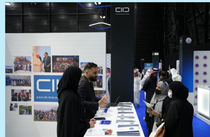
KAICIID's participation at the Saudi Media Forum in Riyadh, Saudi Arabia.