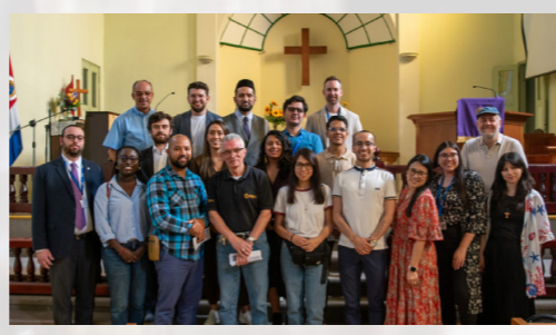
KAICIID Fellows: 2024 Latin America Cohort