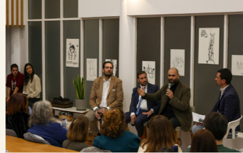
KAICIID-supported Network for Dialogue initiative hosts an interfaith gathering for the N4D members MEERU from Porto and Blanquerna Observatory from Barcelona in Portugal.