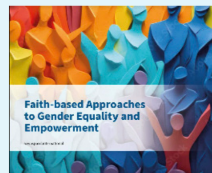
Faith-based Approaches to Gender Equality and Empowerment" booklet, featuring contributions from KAICIID.

KAICIID underscores its dedication to nurturing an environment where women are not only burgeoning but also leading the way in fostering intercultural and interreligious dialogue. On International Women's Day (IWD), KAICIID organized a retreat that empowered its female colleagues through meditation practices, fostering a sense of community and mutual support.