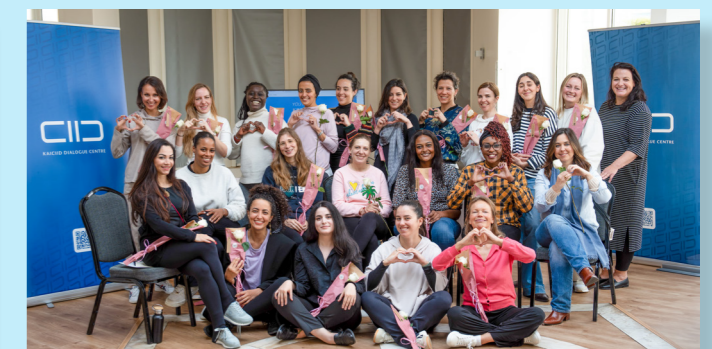
KAICIID honours female staff during International Women's Day