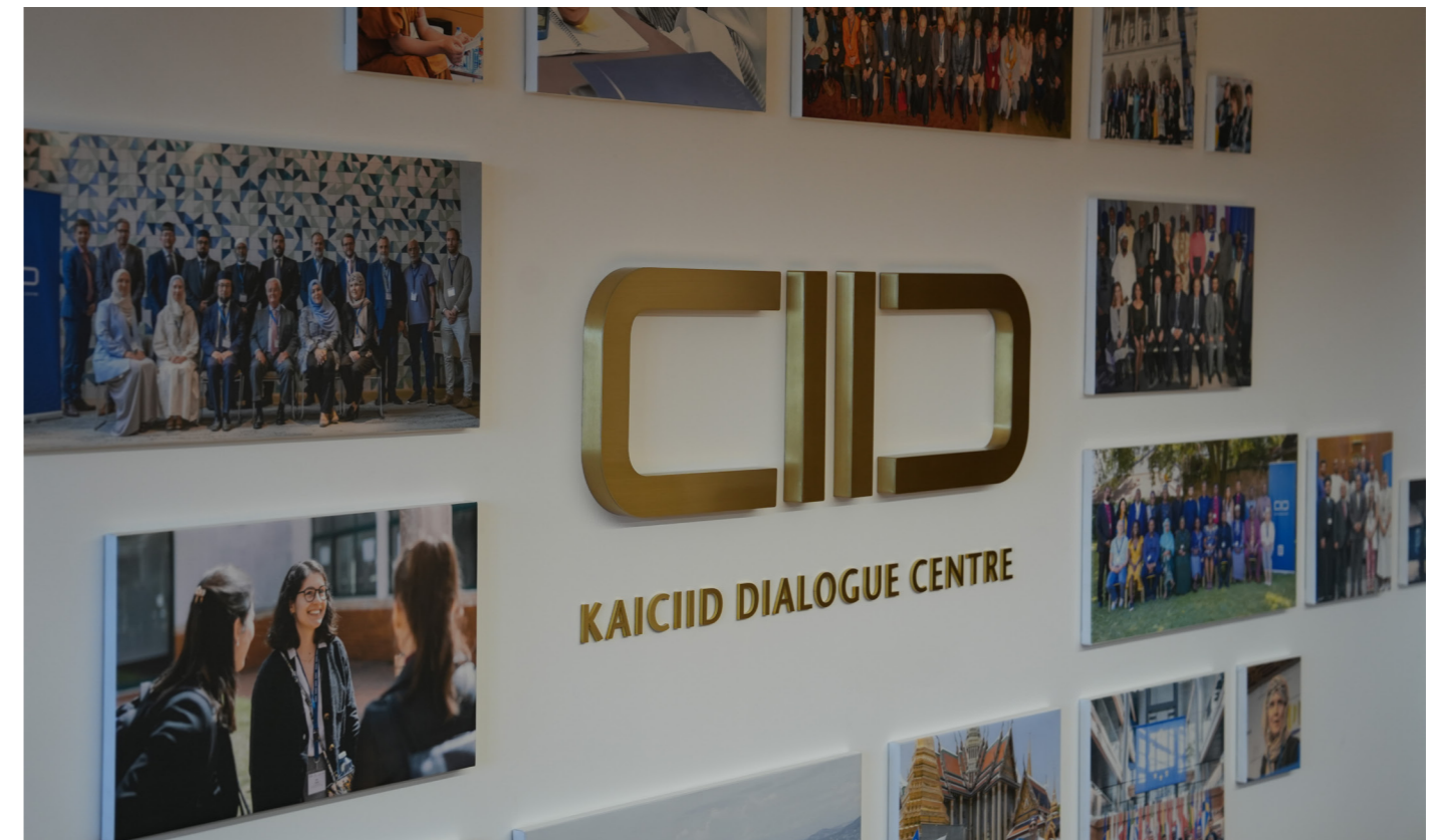
A representation of KAICIID conferences and events across the globe

The kick-off meeting for Dialogue 360 was enhanced with Arabic/English interpretation services, showcasing EMS capability to support multilingual online events effectively.