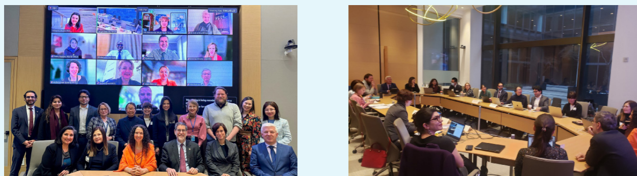
KAICIID participating in the Multi-Faith Advisory Council to the Inter-Agency Taskforce on Religion and Development (IATF-MFAC)