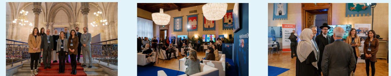
KAICIID's participation at the Fundamental Rights Forum

This interaction highlighted the potential of youth to bridge divides and promote mutual respect across different communities.