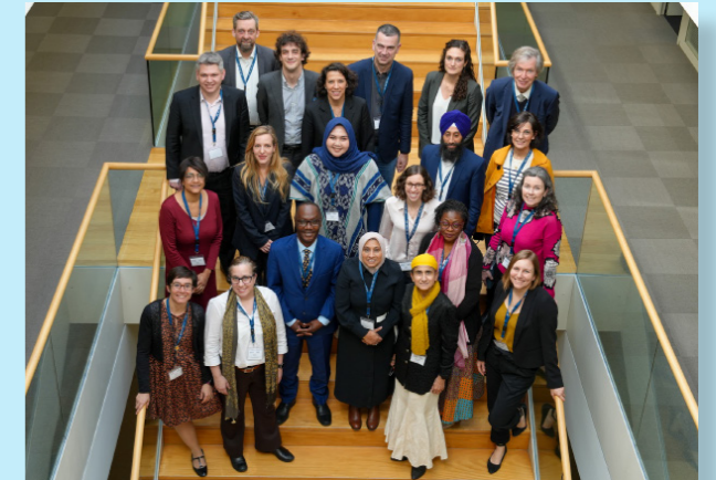
PaRD leadership meeting in Lisbon, Portugal.