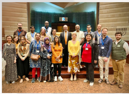
KAICIID Fellows: 2024 International Cohort