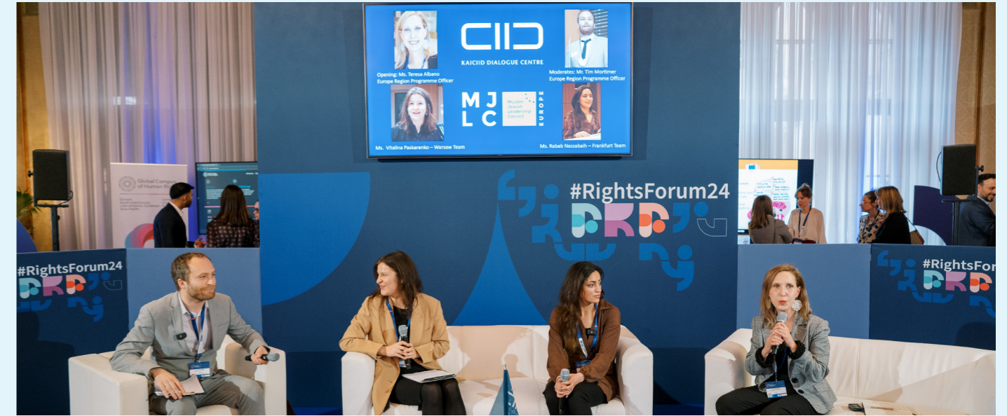
KAICIID's session at the Fundamental Rights Forum

From interfaith events in Porto and London to policy briefs addressing key societal challenges, KAICIID's initiatives are paving the way for more inclusive European cities. These efforts emphasize the power of dialogue, youth engagement, and leadership in cultivating communities where everyone belongs.