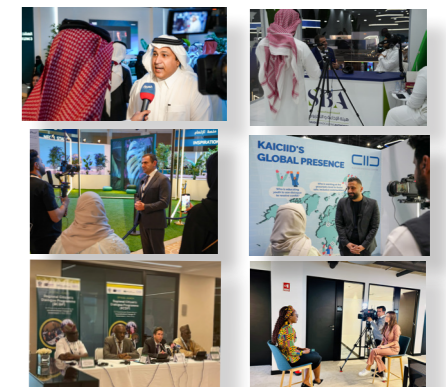
KAICIID in the Media