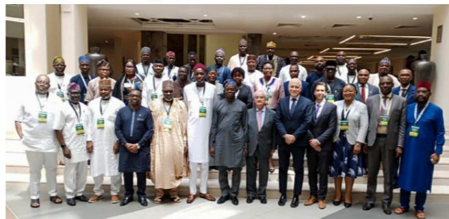
The Regional Citizen's Dialogue Programme (RCDP) launch with KAICIID as a core partner

This initiative, with KAICIID as a key partner, emphasizes the power of collective action among civil society, faith-based organizations, and international bodies