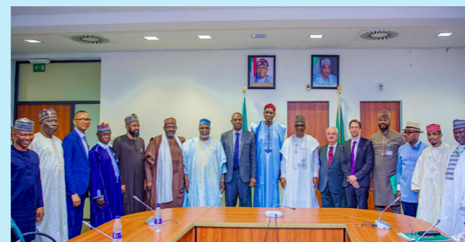
Regional Citizens' Dialogue Program launch in Abuja, Nigeria.