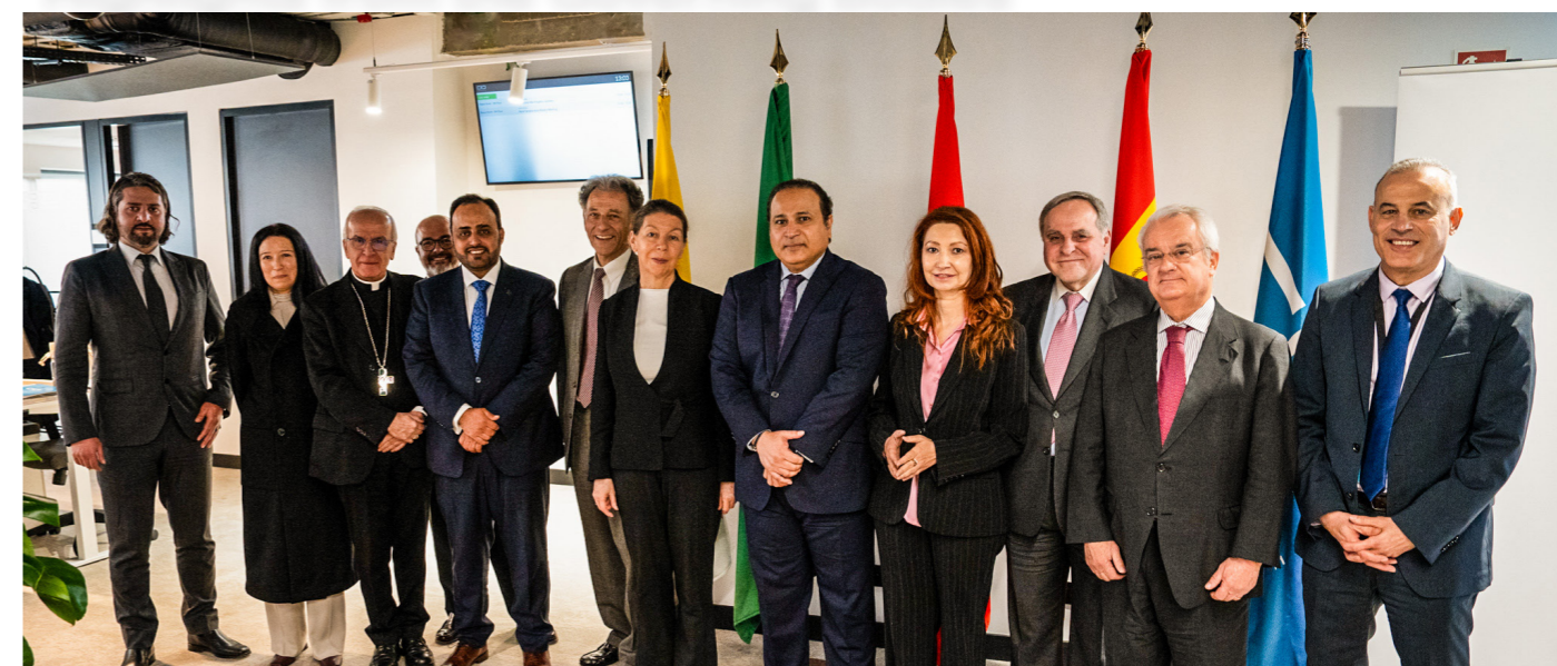
Family photo after KAICIID's Council of Parties meeting in Lisbon, Portugal.