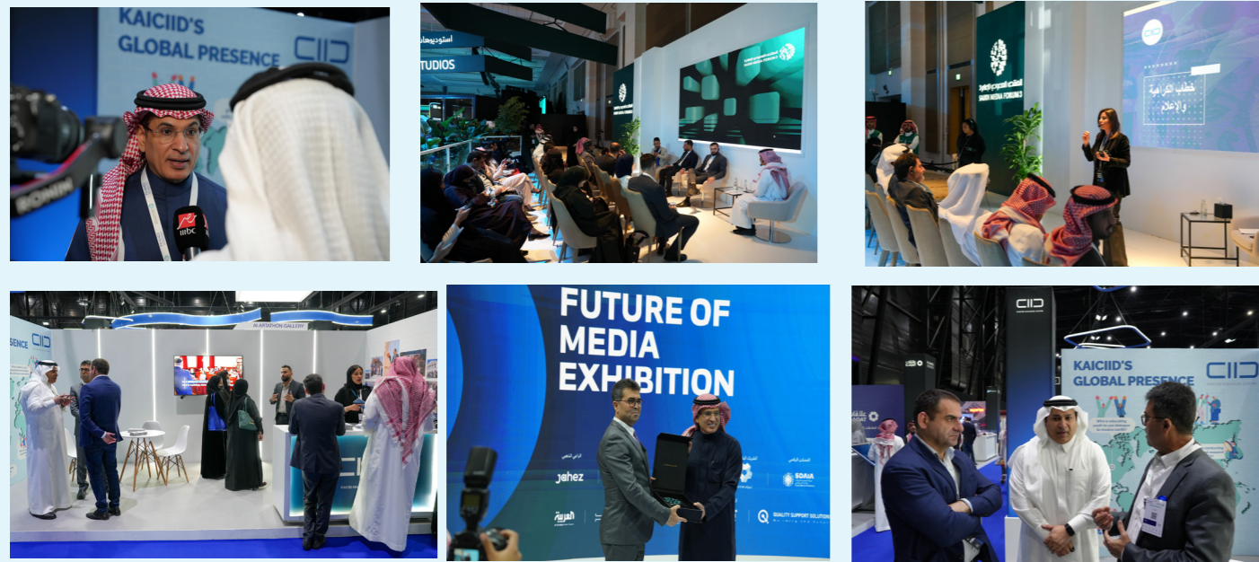
KAICIID's participation at the Saudi Media Forum (SMF) as a knowledge partner.

KAICIID's collaboration with the Saudi Media Forum as a knowledge partner highlights the critical role of media in peacebuilding. Through engaging panels and interactive sessions, the event spotlighted the importance of inclusive narratives, women's contributions to media, and youth initiatives against hate speech, reinforcing the media's role in fostering dialogue and understanding.