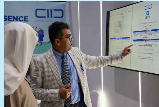
KAICIID's participation at the Saudi Media Forum in Riyadh, Saudi Arabia.