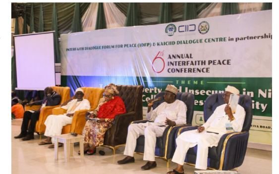
6th Annual Interfaith Peace Conference in Kaduna, supported by KAICIID

From 4 to 7 March, the Interfaith Dialogue Forum for Peace (IDFP) hosted its 6th Annual Interfaith Peace Conference in Kaduna, supported by KAICIID and the Executive Governor of the State, Senator Uba Sani. This was a milestone for the IDFP and underscored the vital role of interfaith collaboration between religious leaders and policymakers in promoting peace and religious harmony, particularly in Kaduna, a key Nigerian state. The conference served as a blueprint for future IDFP peace conferences and contributed to the Forum's long-term goals. The abduction of over 280 school pupils in Kuriga, Kaduna, on the conference's final day, tragically emphasized the urgency and necessity of such peace-promoting initiatives.