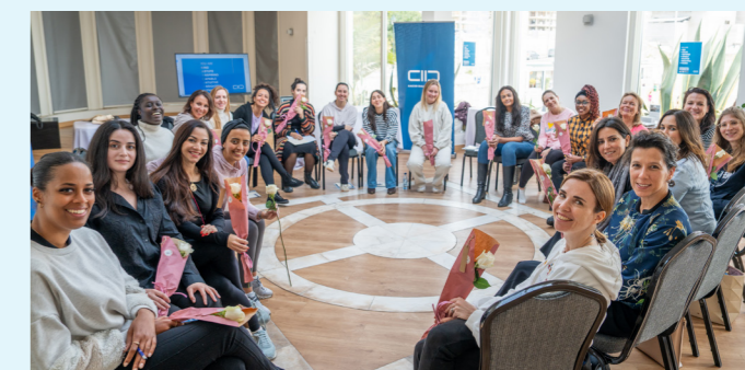
KAICIID female staff during the IWD retreat