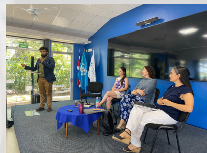
KAICIID Fellows training session at the University of Peace

This curriculum was not just about theory; it was a hands-on approach to fostering social cohesion and resilience in the face of contemporary challenges by visiting religious and cultural landmarks in San Jose, Costa Rica, such as the Orthodox Jewish Cultural Centre of San Jose, Omar Mosque and Islamic Cultural Centre, a Methodist church and the Metropolitan Cathedral of San Jose. This was a great opportunity for the Fellows to learn about the diversity within and the history of Costa Rica.