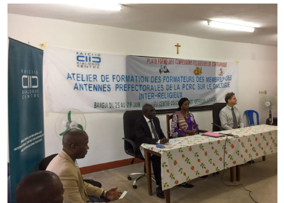
KAICIID at Bangui University during one of the initial missions

KAICIID is actively fostering peace and coexistence through educational programs at the University of Bangui in the Central African Republic (CAR), focusing on enhancing skills in conflict prevention and management. In 2023, KAICIID aided the University of Bangui in creating coursework on Interreligious Dialogue (IRD) for its Master's degree curriculum in Conflict Management and Resolution. This academic year has seen the enrollment of over 50 Master's students, some of whom will join a francophone research and practice center on IRD, co-run by the University, KAICIID, and local stakeholders. This initiative is set to build a cadre of well-informed peacebuilders, equipped with the knowledge and practice of IRD to generate research and provide tangible evidence of its effectiveness in conflict resolution, thereby nurturing interfaith harmony in the region.